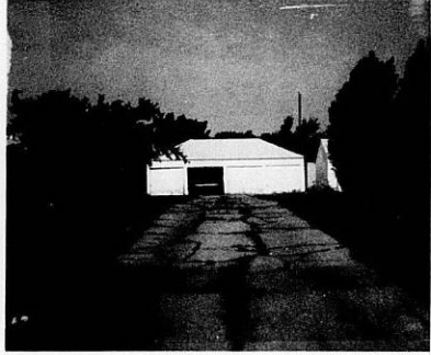
Looking W of drive S