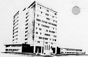
SEDGWICK COUNTY COURTHOUSE