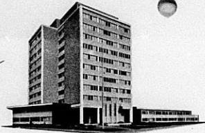
SEDGWICK COUNTY COURTHOUSE