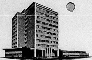
SEDGWICK COUNTY COURTHOUSE