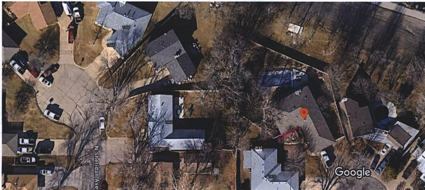
20 ft