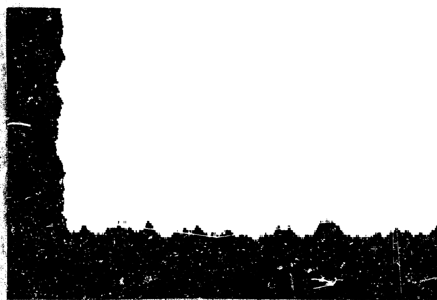
B.M. 11429 T IN TROP. ON CURB N.Y.C. S.W. COR. MATH AVE + 3rd ST

Property 613.5 + 12.7 = 626.2 626.2 x 17.0 = 10645.4 10645.4 x 1.7 = 18107.2 18107.2 x 18.7 = 338604.54