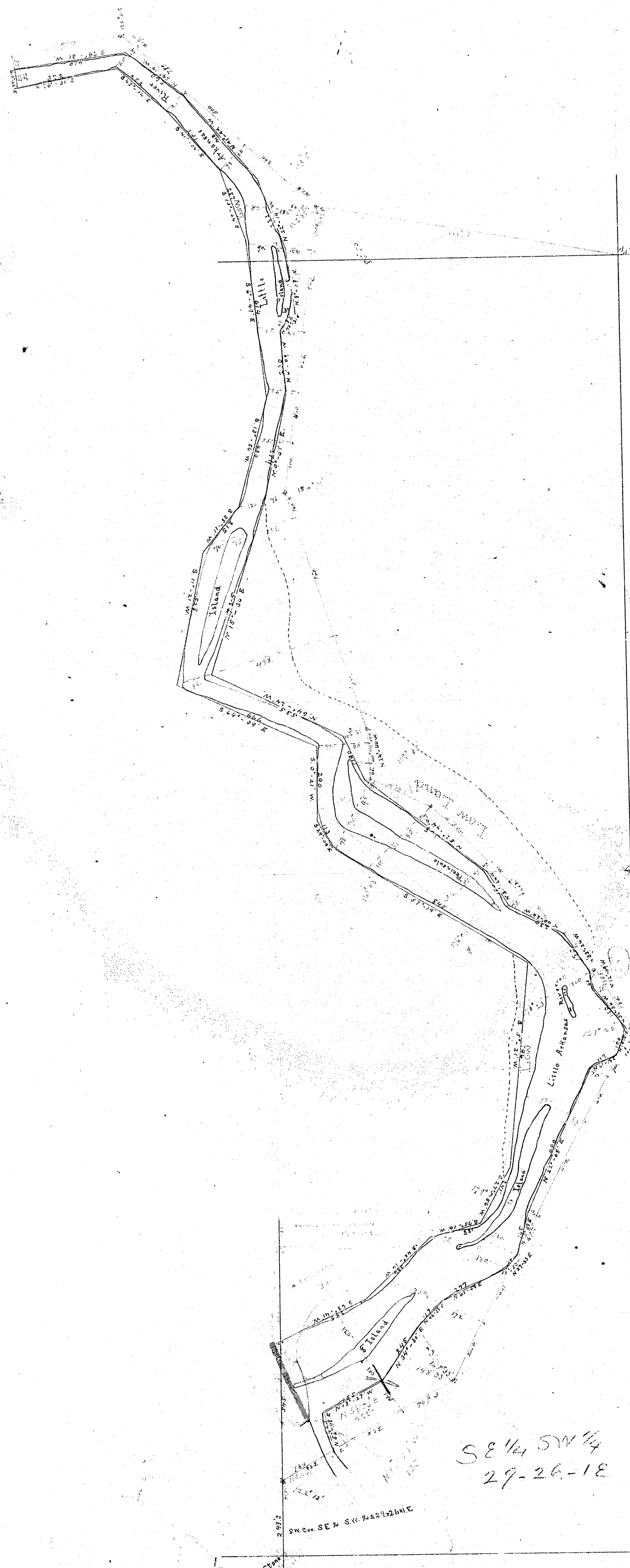
Map of Mill Pond and Little Arkansas River North from the Dam in Sec. 29, T. 26 S., R. 1 E., 6 P.M.