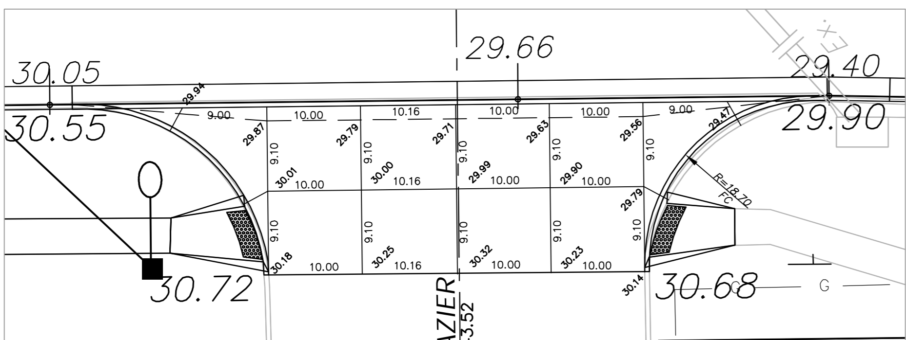
Valley Gutter Detail

Note: Trees/Shrubs to be removed are marked thus: Note: Pavement, Sidewalks, and Etc. To Be Removed Are Indicated By: