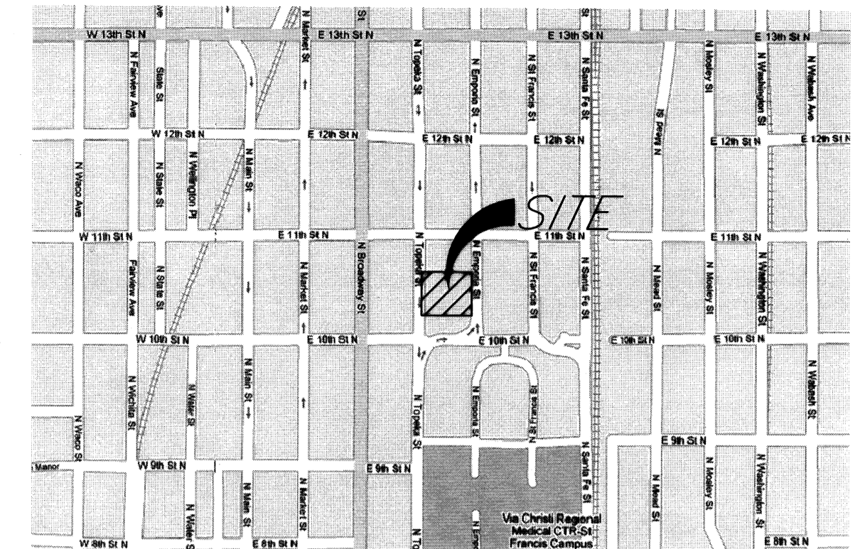
LOCATION MAP (For Visual Use Only)