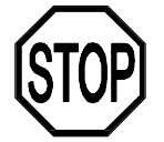
R1-1 1200mm x 1200mm