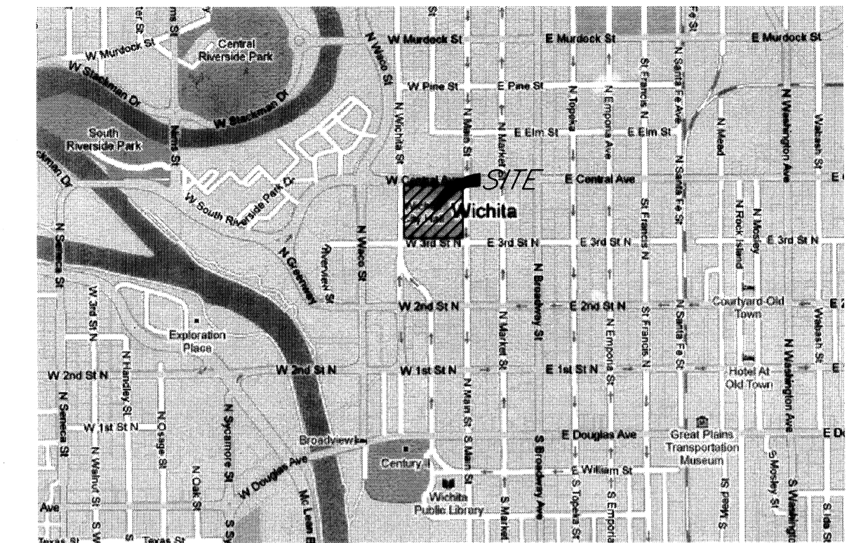
LOCATION MAP (For Visual Use Only)