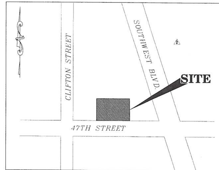
WICHITA, KANSAS VICINITY MAP NOT TO SCALE