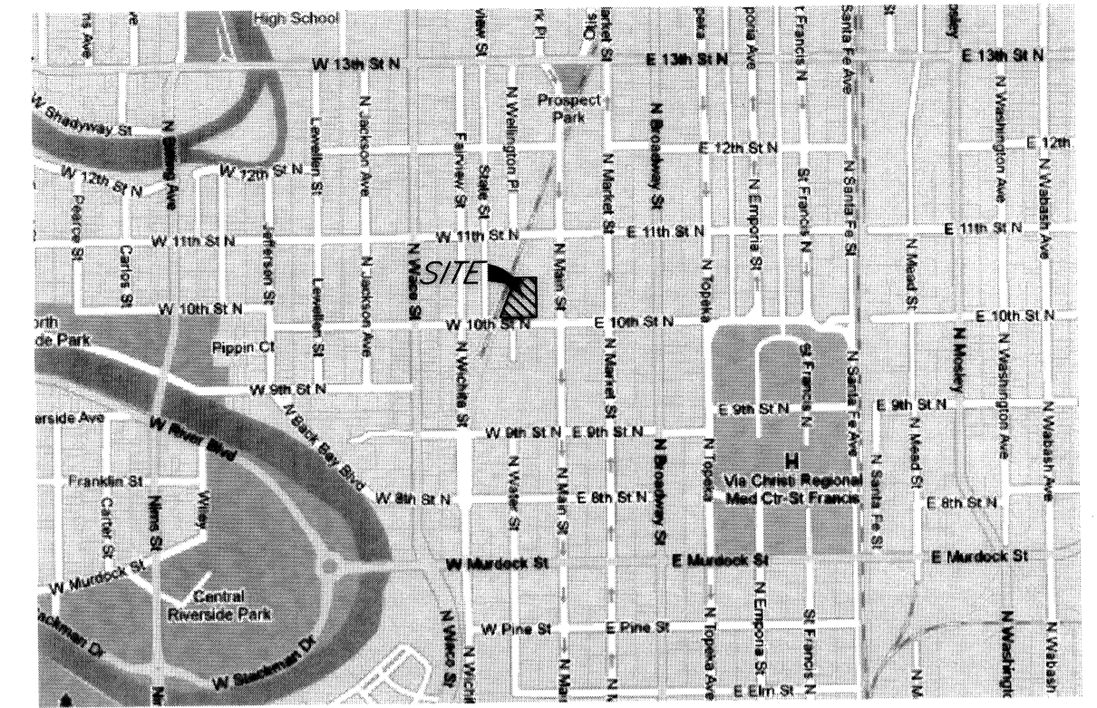
LOCATION MAP (For Visual Use Only)