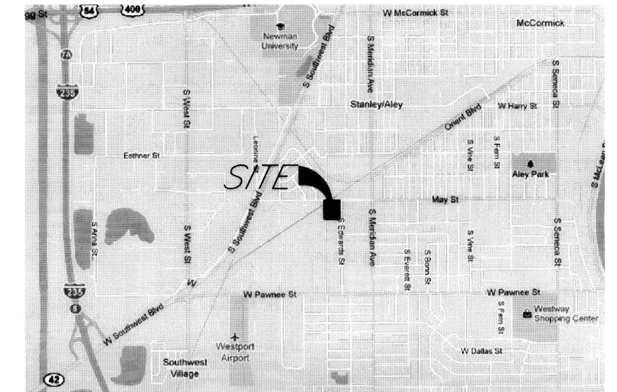
LOCATION MAP (For Visual Use Only)