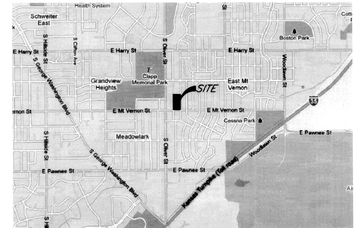
LOCATION MAP (For Visual Use Only)