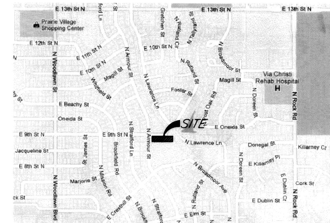
LOCATION MAP (For Visual Use Only)