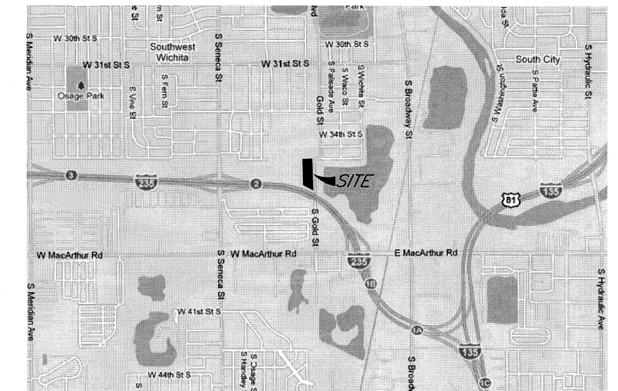
LOCATION MAP (For Visual Use Only)