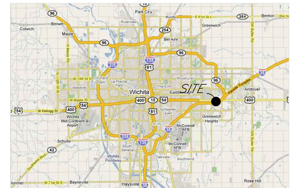
LOCATION MAP (For Visual Use Only)