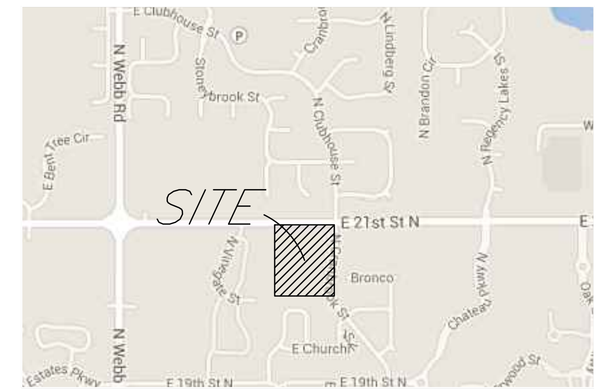
LOCATION MAP (For Visual Use Only)