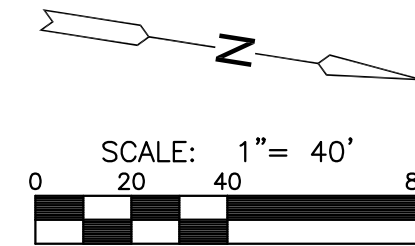
PLAN LINE 1 PROFILE LINE 1

NOTE: CONTRACTOR TO VERIFY LOCATION AND ELEVATION OF EXISTING WATER LINES AND ALL OTHER UTILITIES PRIOR TO CONSTRUCTION.