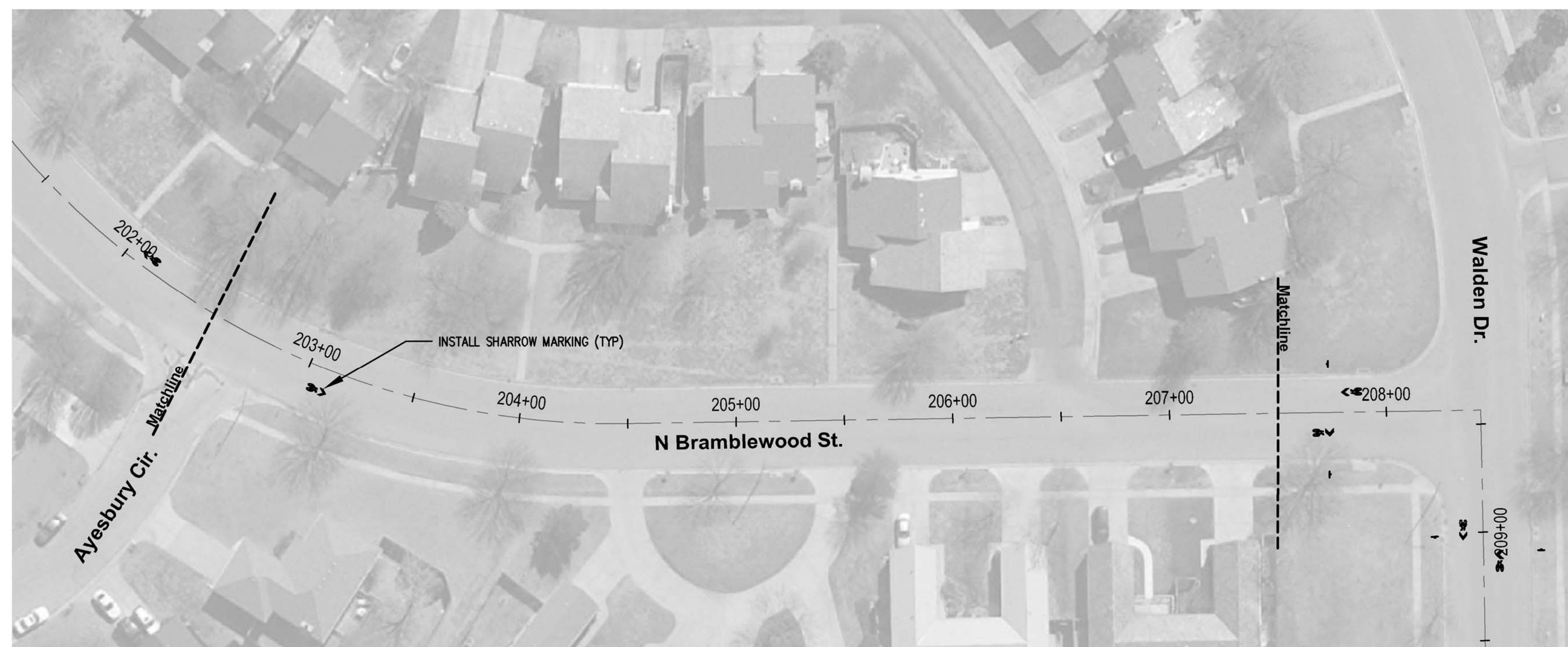
STA 202+50 TO STA 207+50