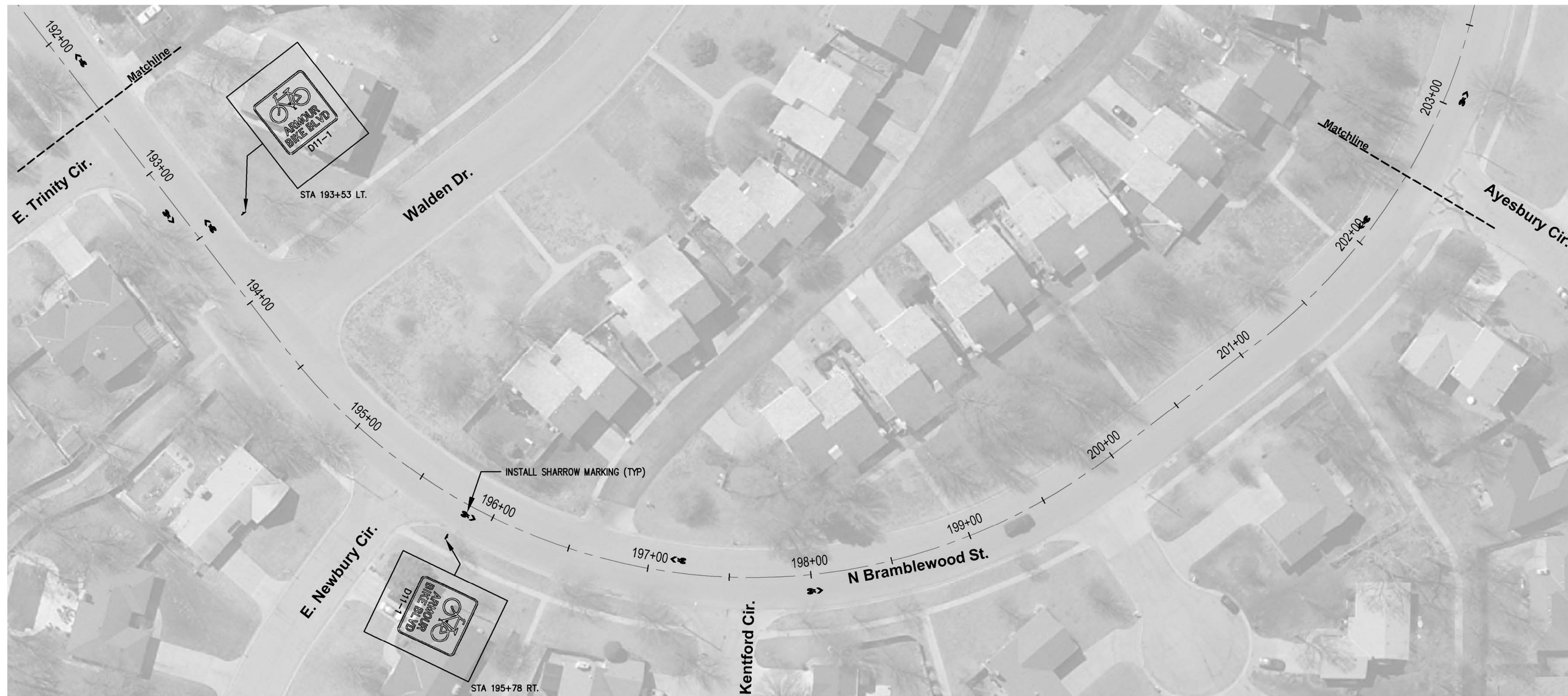
STA 192+50 TO STA 202+50