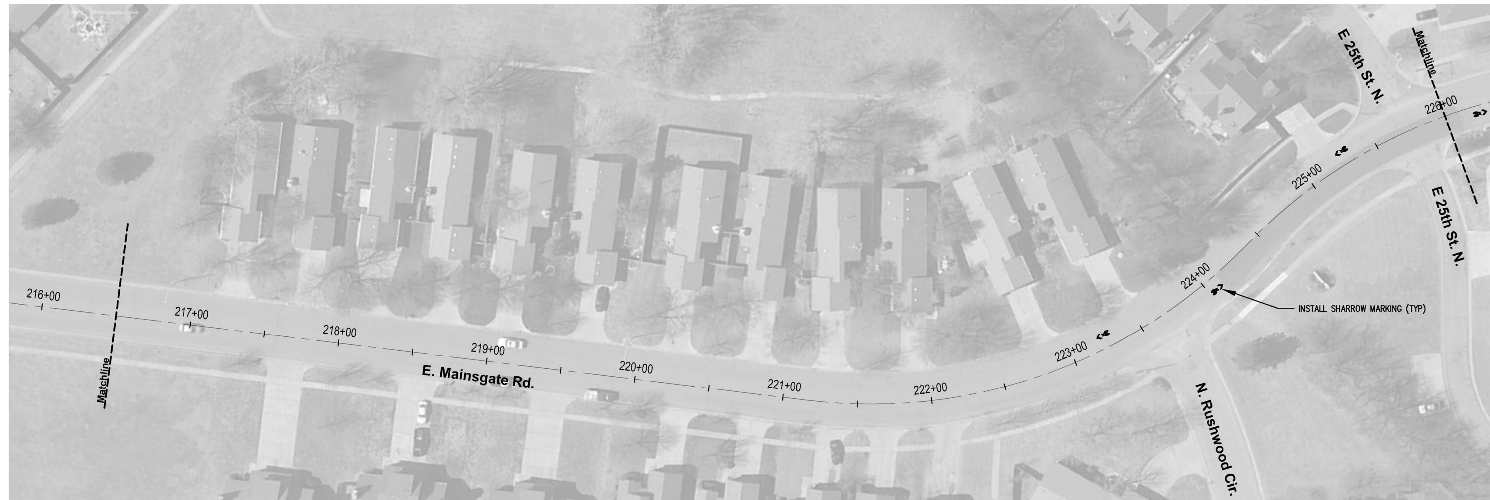
STA 216+50 TO STA 226+00