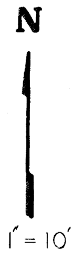
EXHIBIT FOR PARTIAL EASEMENT VACATION

LOT 21 BLOCK 2. MILES LAKEWOOD VILLAGE SECOND ADDITION WICHITA SEDGWICK COUNTY KANSAS