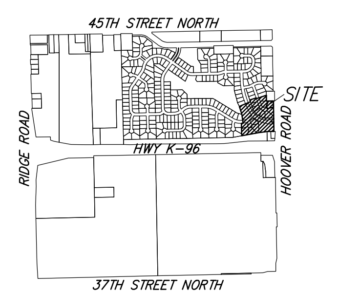
VICINITY MAP SEC. 27, T26S, R11W

PP = Power Pole ATT Ped = ATT Pedestal Guy = Guy Anchor Sign = Sign