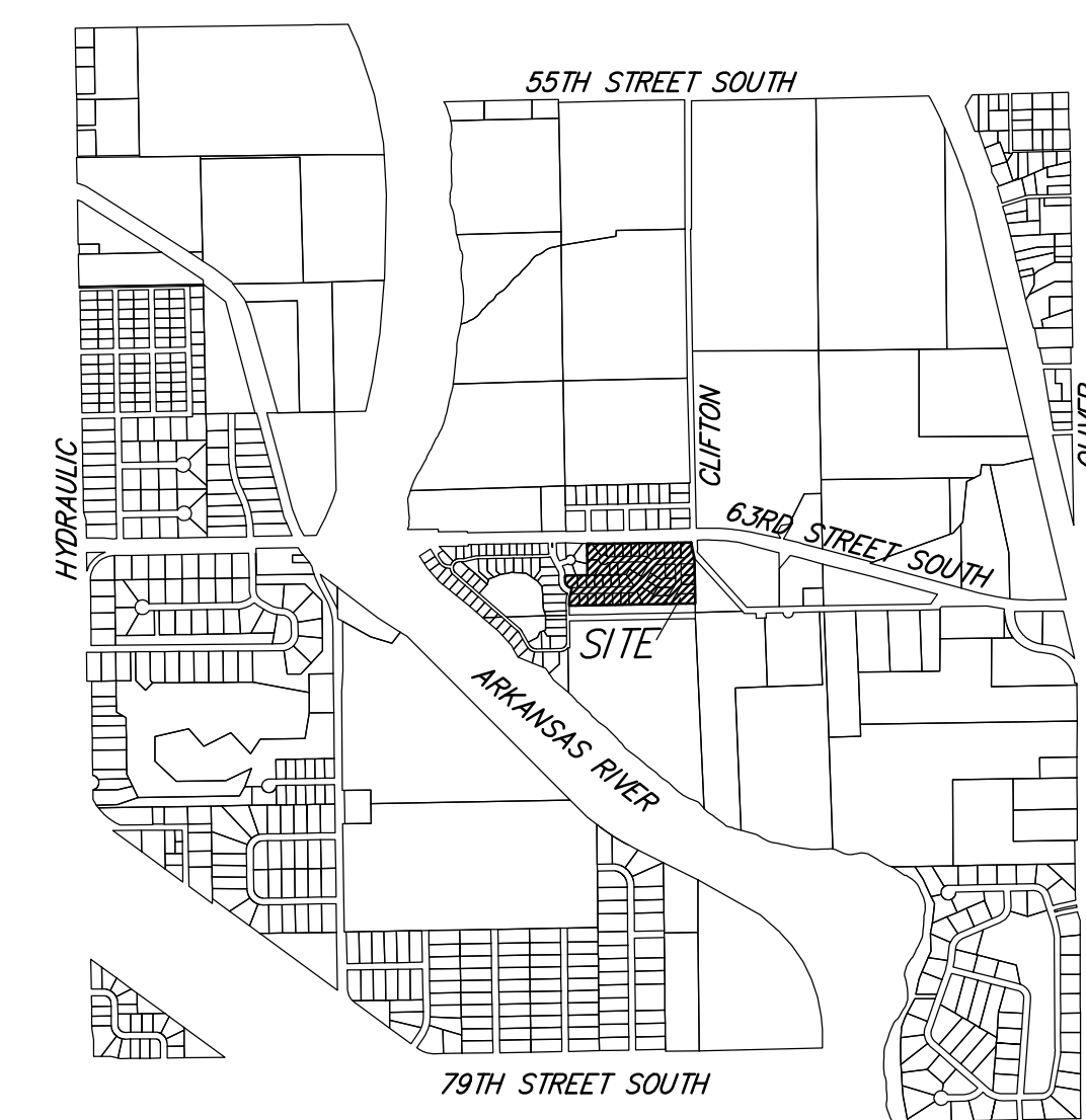
VICINITY MAP SEC. 27, T28S, R1E SEC. 26, T28S, R1E SEC. 34, T28S, R1E SEC. 35, T28S, R1E

□ PP = Power Pole □ ATT Ped = ATT Pedestal — Guy = Guy Anchor Ⓢ Sign = Sign