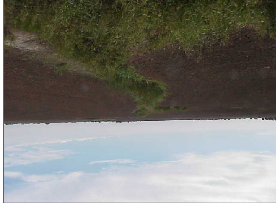
Looking south from Bridge on 23rd Street.