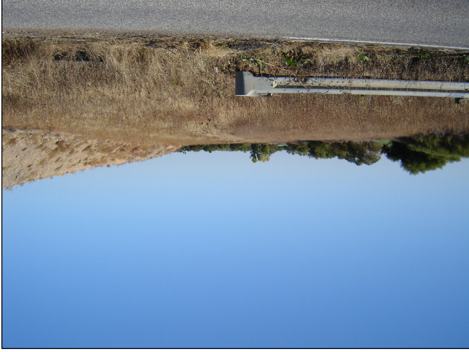
Fill placed north of bridge with Turkey Creek Addition Project.