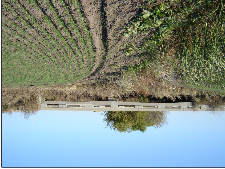
23rd Street South Bridge