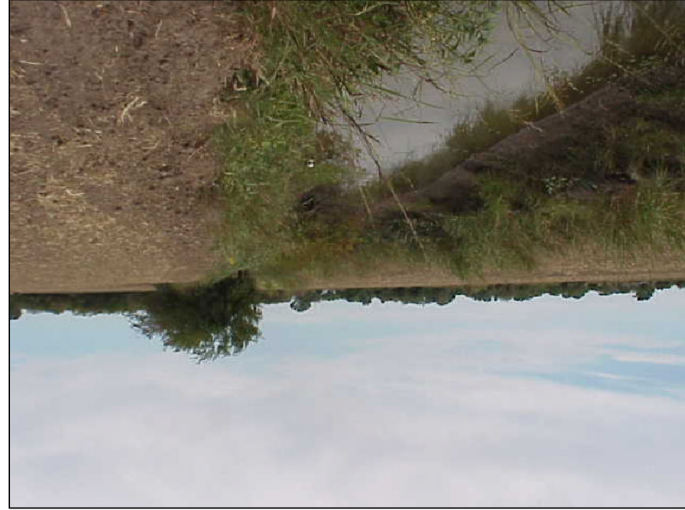
Looking west along north tributary (Approx. Section 29538)