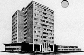
SEDGWICK COUNTY COURTHOUSE