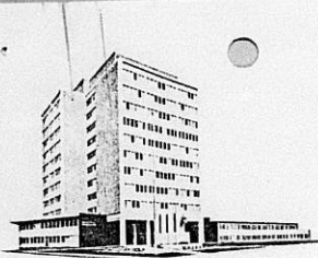
SEDGWICK COUNTY COURTHOUSE