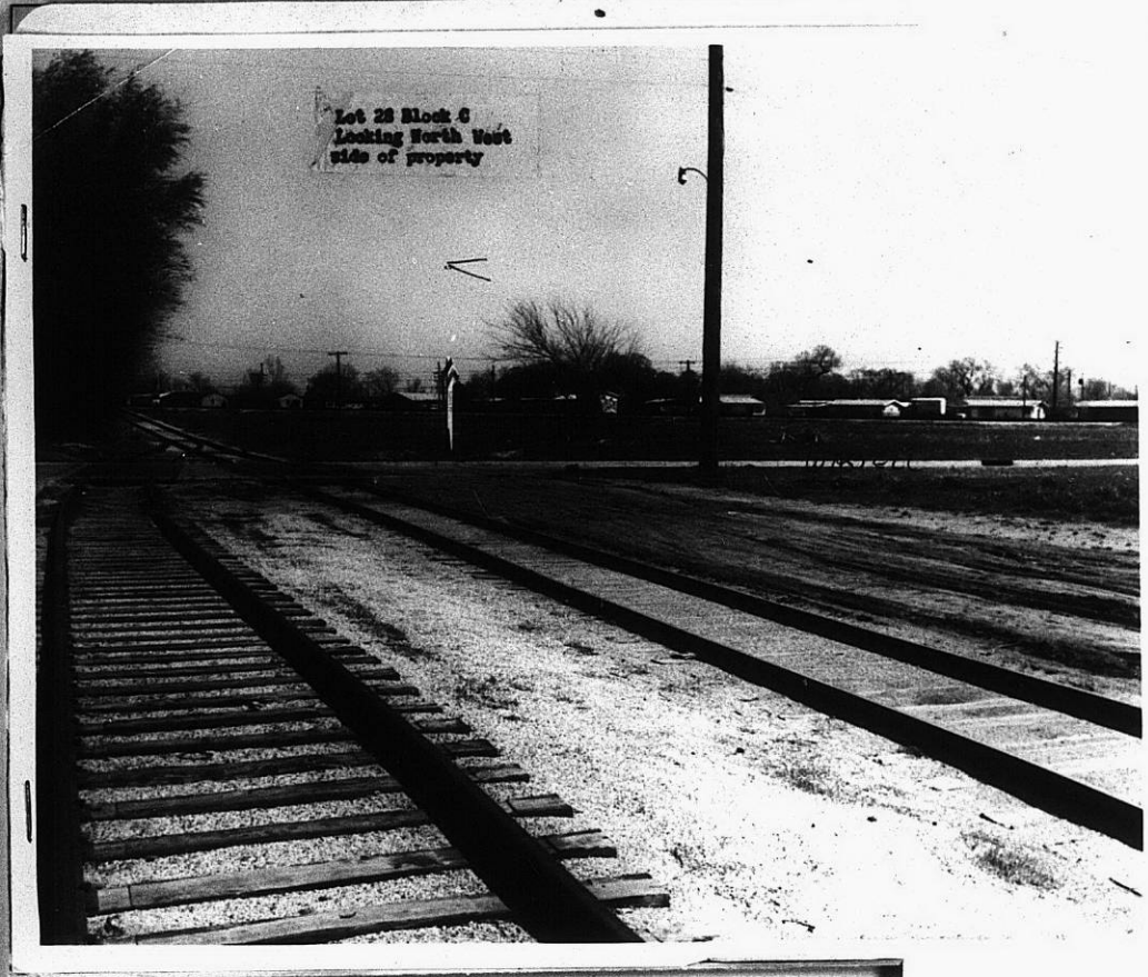
Lot 28 Block 6 Looking North West side of property