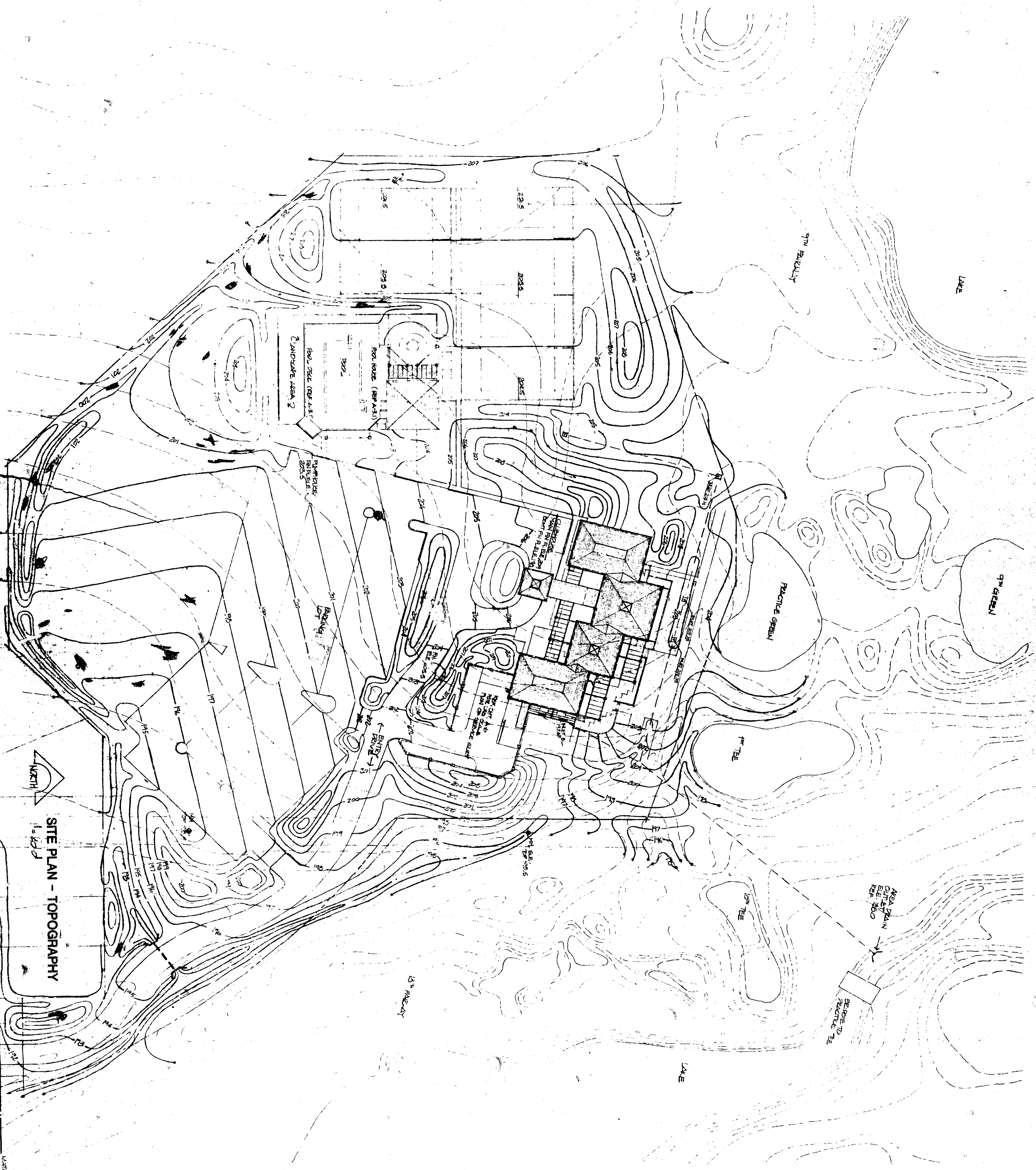
SITE PLAN - TOPOGRAPHY