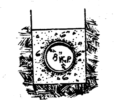
DETAIL OF ENFORCEMENT CONC.

PRIVATE SEWER CONTRACT - LEMON ADD. CITY OF WICHITA, KANSAS L.K. WHITE CITY ENGINEER 1950