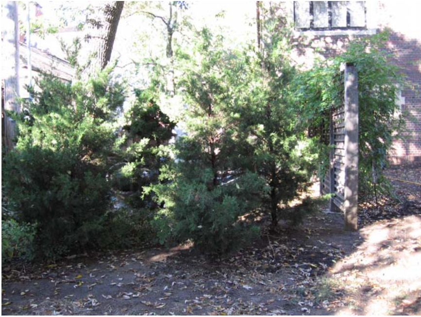
Standing just east of the excavation site, looking west. The lattice fence may need to be temporarily removed and some of these cedars may need to be removed.