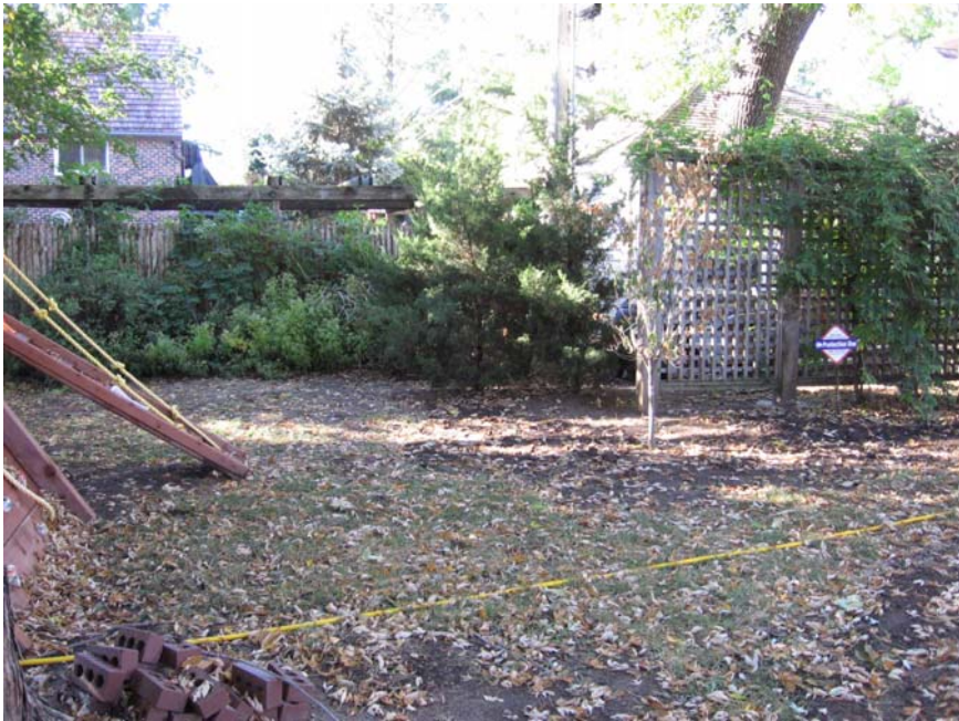
Standing at the north end of the playground equipment, looking southwest toward the excavation area.