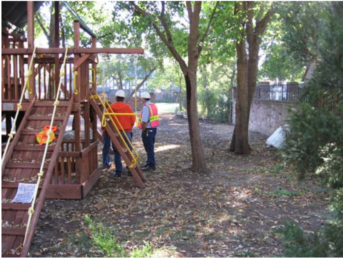
Looking northeast and east of the excavation area to show the playground equipment.