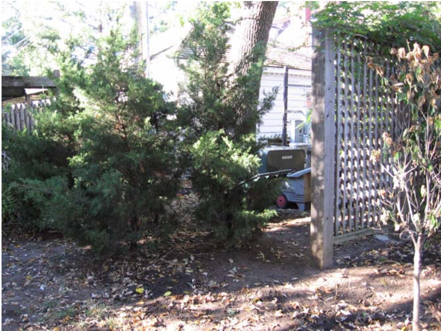
Standing northeast of the excavation area, looking southwest. (the large trunk tree is further away than it looks in this picture)