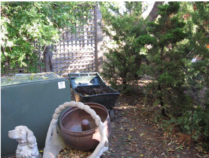
Standing south/southwest of the excavation site, looking northerly. There is a transformer box in the vicinity, so the manhole will be constructed fairly close to the south side of the lattice fence (northeast of the transformer box).