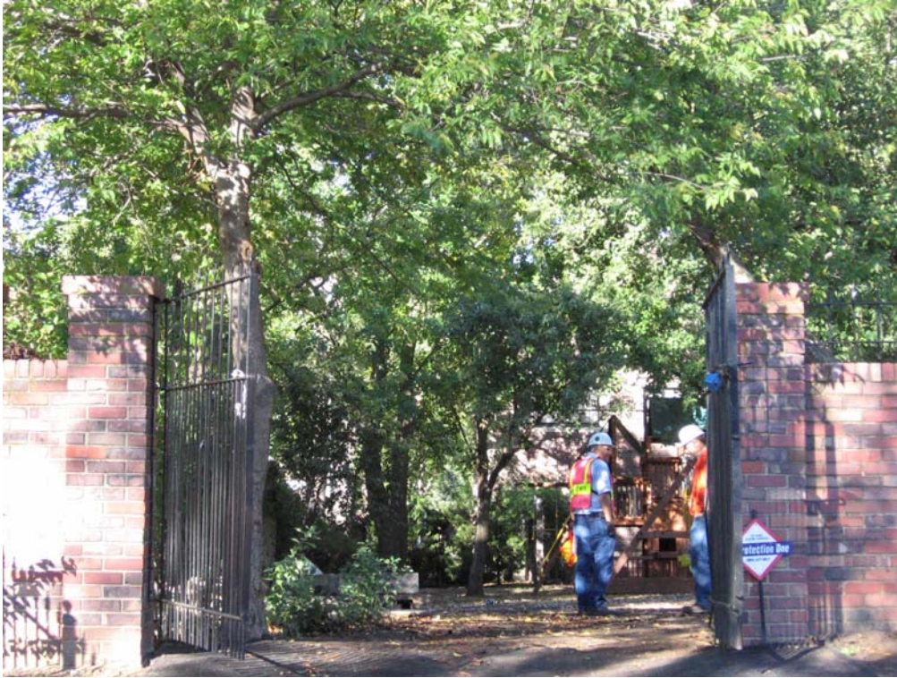
Standing in Crestway Street, looking west through the access gate. Note that there is a tree at the entrance which limits the width of the access.