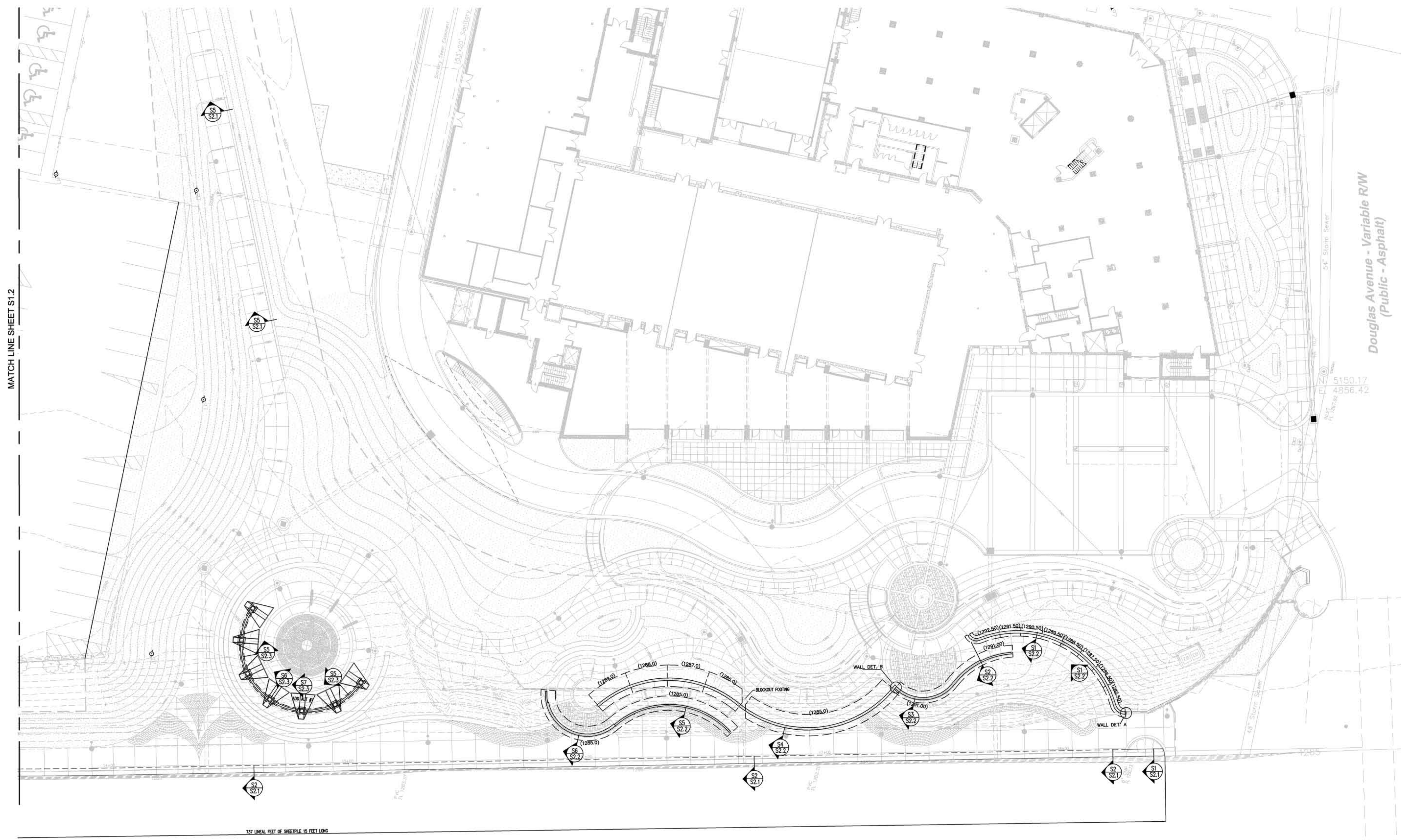
A STRUCTURAL PLAN 1"=20'-0" NORTH