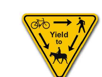
SHARE THE TRAIL SIGN