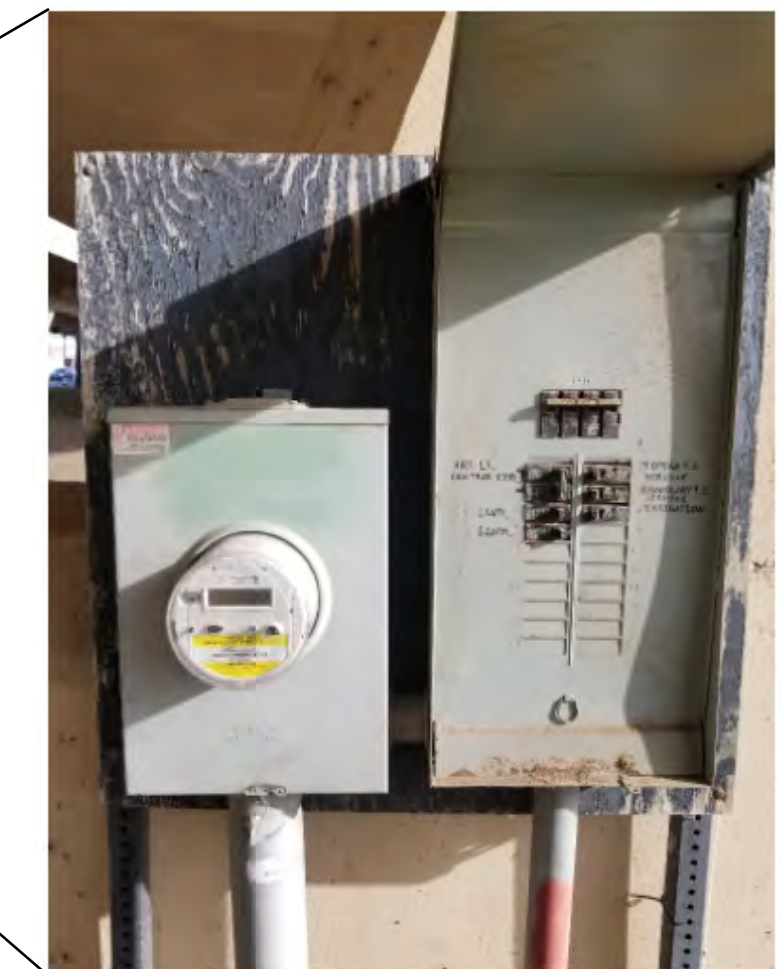
EXISTING 200 AMP SERVICE. COORDINATE HOOK-UP WITH WESTAR.