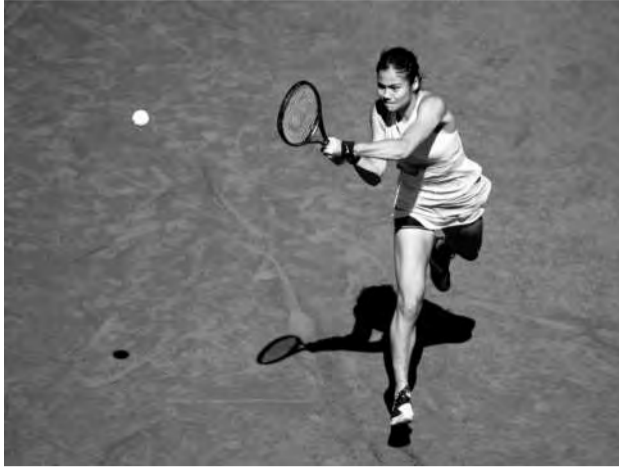
THIBAULT CAMUS AP

The 12th-seeded Raducanu failed to convert on five break-point chances at 1-1 in the third set as