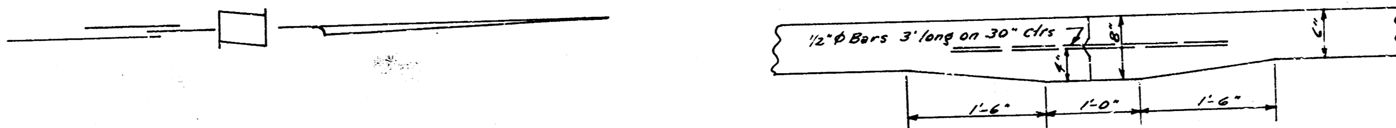
Mastic Joint Detail No Scale

BM 115.43 N.W. COR. CONC. PORCH HOUSE #602 SE COR. UNIVERSITY & SHERIDAN BM 113.82 16" IN GLOBE E. N.E. E. COR. SHERIDAN & MAPLE BM 114.018 CITY BM 41' N 122' E OF E-SHERIDAN & MAPLE STATIONING ON E. OF SHERIDAN