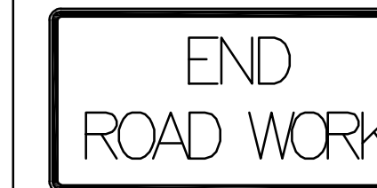
KG20-2 (BLACK ON ORANGE)