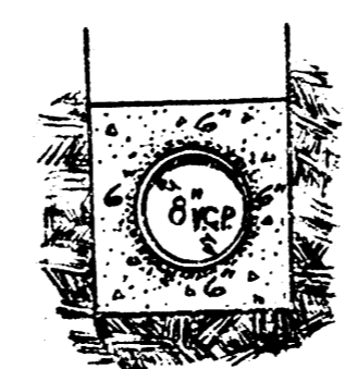
DETAIL OF ENCLOSURE CONC.

PRIVATE SEWER CONTRACT - LEMON ADDN. CITY OF WICHITA, KANSAS L.K. WHITE CITY ENGINEER 1950