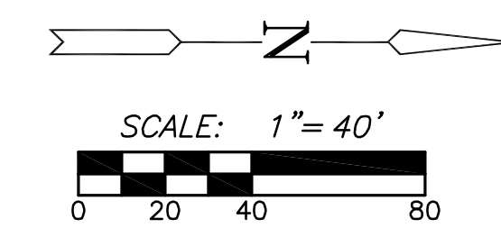
MONARCH LANDING SECOND ADDITION

NOTE: MANHOLES SHALL BE LINED PER CITY OF WICHITA STD SPEC. USING RAVEN 405, SAUERREISEN, WARREN ENVIRONMENTAL 5301, OR ZEBRON MANHOLE LINERS.