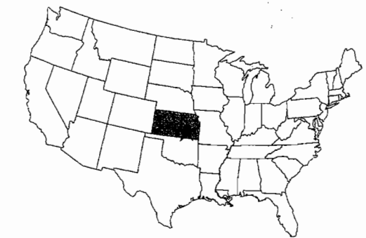
STATE LOCATION MAP

NOTE TO CONTRACTORS INSTALLATION, INSPECTION AND TESTING FOR THIS PROJECT IS TO BE PROVIDED BY A LICENSED CONSULTING ENGINEERING FIRM UNDER CONTRACT WITH THE OWNER/DEVELOPER. SAID INSPECTION TO BE IN ACCORDANCE WITH THE CITY OF WICHITA STANDARD CONSTRUCTION ENGINEERING PRACTICES AND CERTIFIED BY A LICENSED PROFESSIONAL ENGINEER. NO WORK SHALL BE PERFORMED IN DEDICATED EASEMENTS OR PUBLIC RIGHT-OF-WAY BY THE CONTRACTOR WITHOUT SUCH INSPECTION NOR SHALL ANY WORK BE COMMENCED WITHOUT WRITTEN AUTHORIZATION BY THE CITY ENGINEER. ALL CONSTRUCTION AND MATERIALS SHALL COMPLY WITH THE CITY OF WICHITA SPECIFICATIONS AND STANDARDS (ON FILE AND AVAILABLE IN THE CITY ENGINEER'S OFFICE).