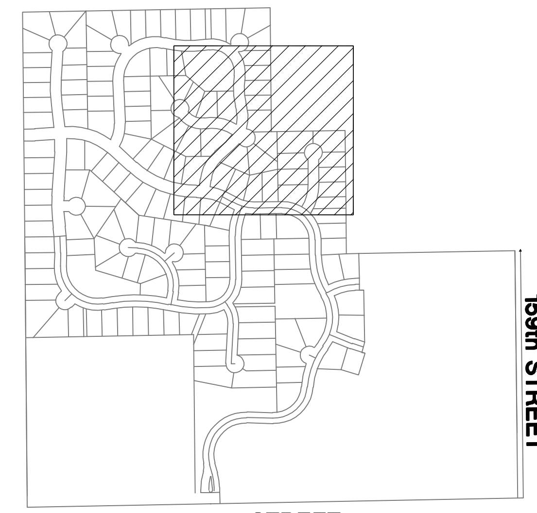
21st STREET VICINITY MAP