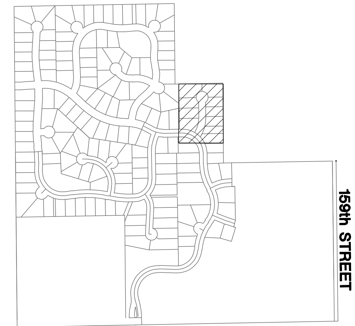
21st STREET VICINITY MAP