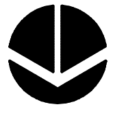
Scale 1" = 20'0"

Drawing File: E:\proj\united\bank arena parking\united\emporia street parking\united\ep site plan.dwg Date: 8/8 Project No: 0603E273 CITY OF WICHITA Emporia PM/AB