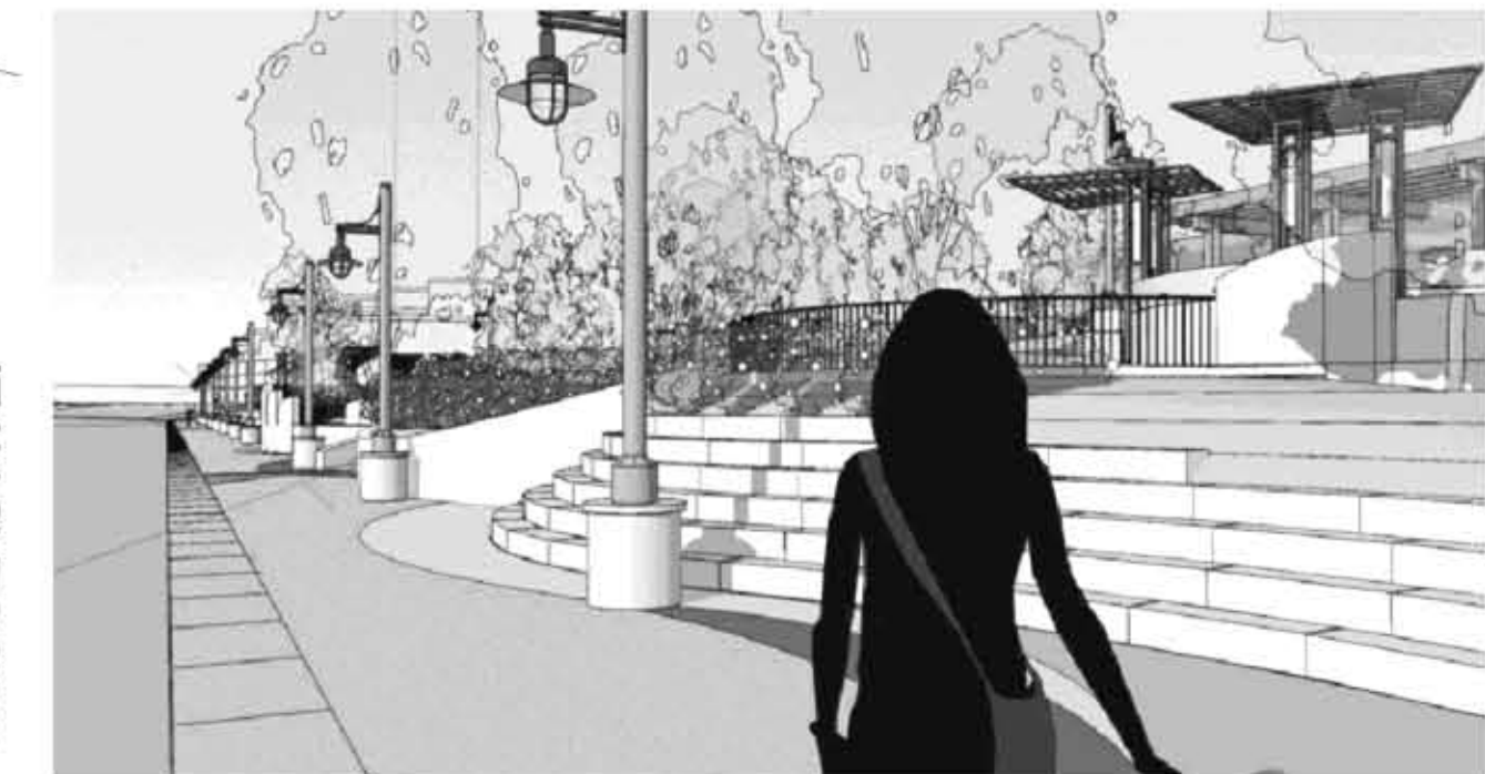
CHARACTER PERSPECTIVE 2