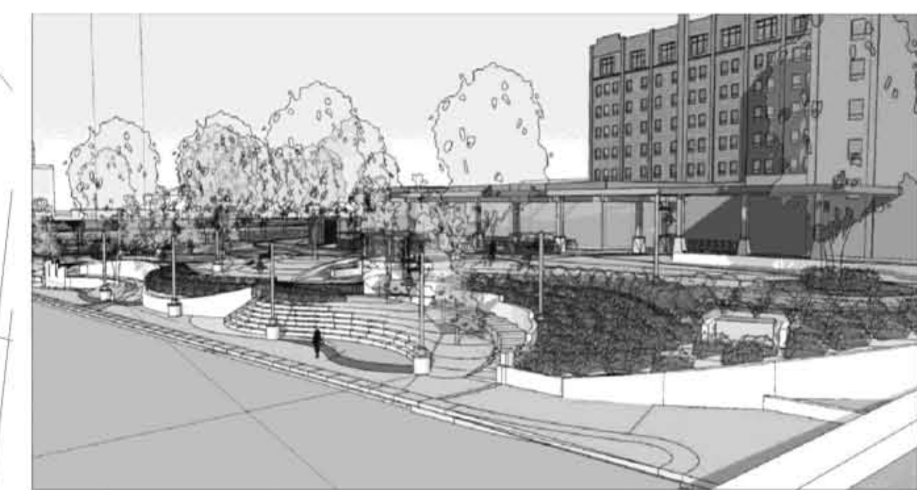
CHARACTER PERSPECTIVE 1