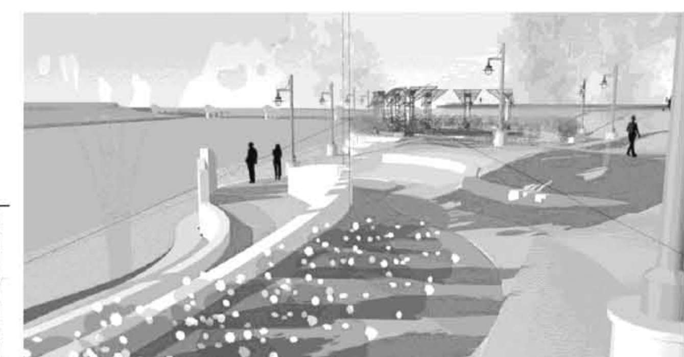
CHARACTER PERSPECTIVE 3