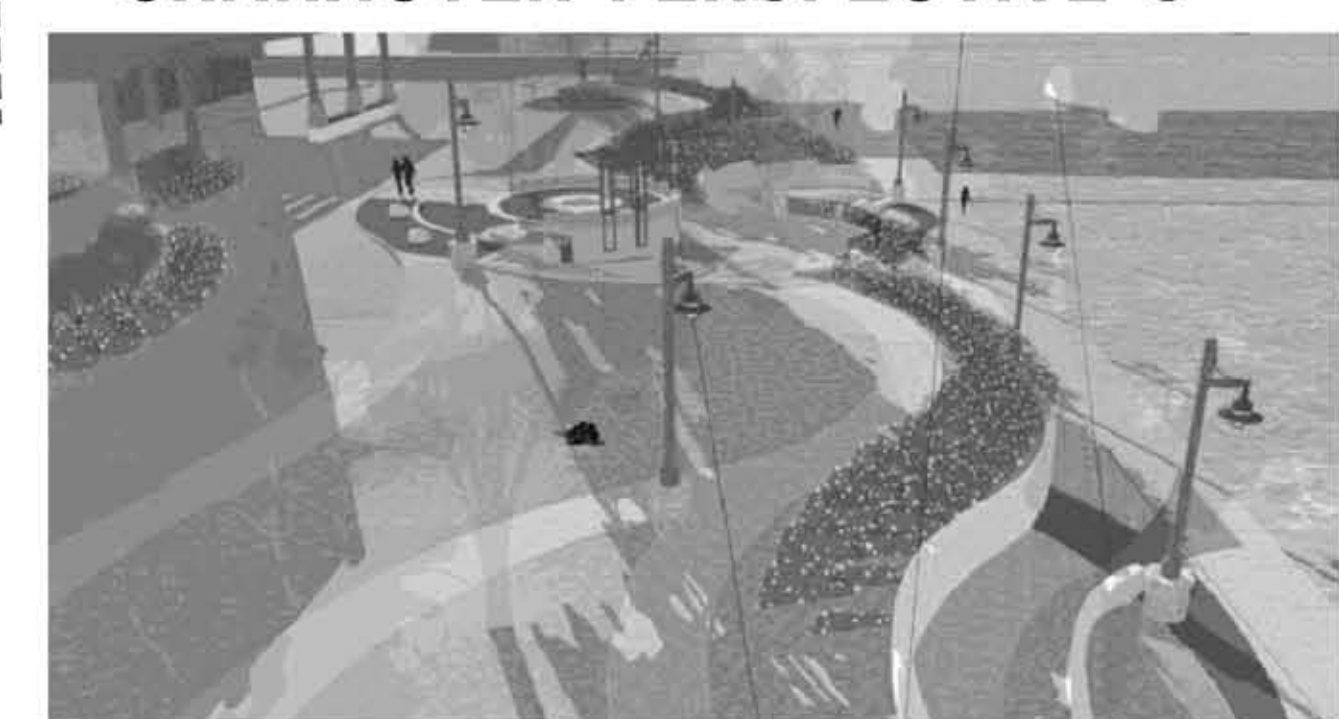
CHARACTER PERSPECTIVE 4