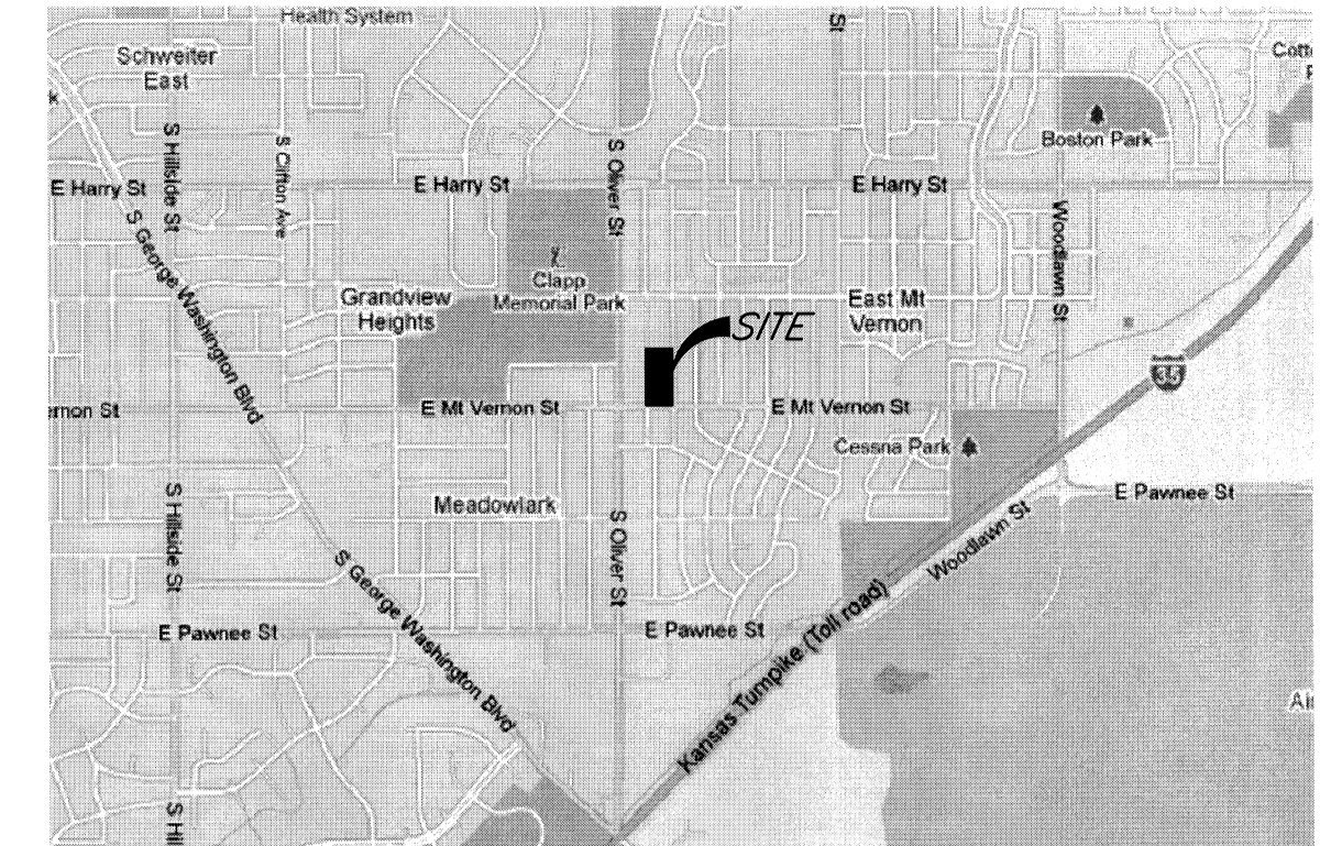
LOCATION MAP (For Visual Use Only)