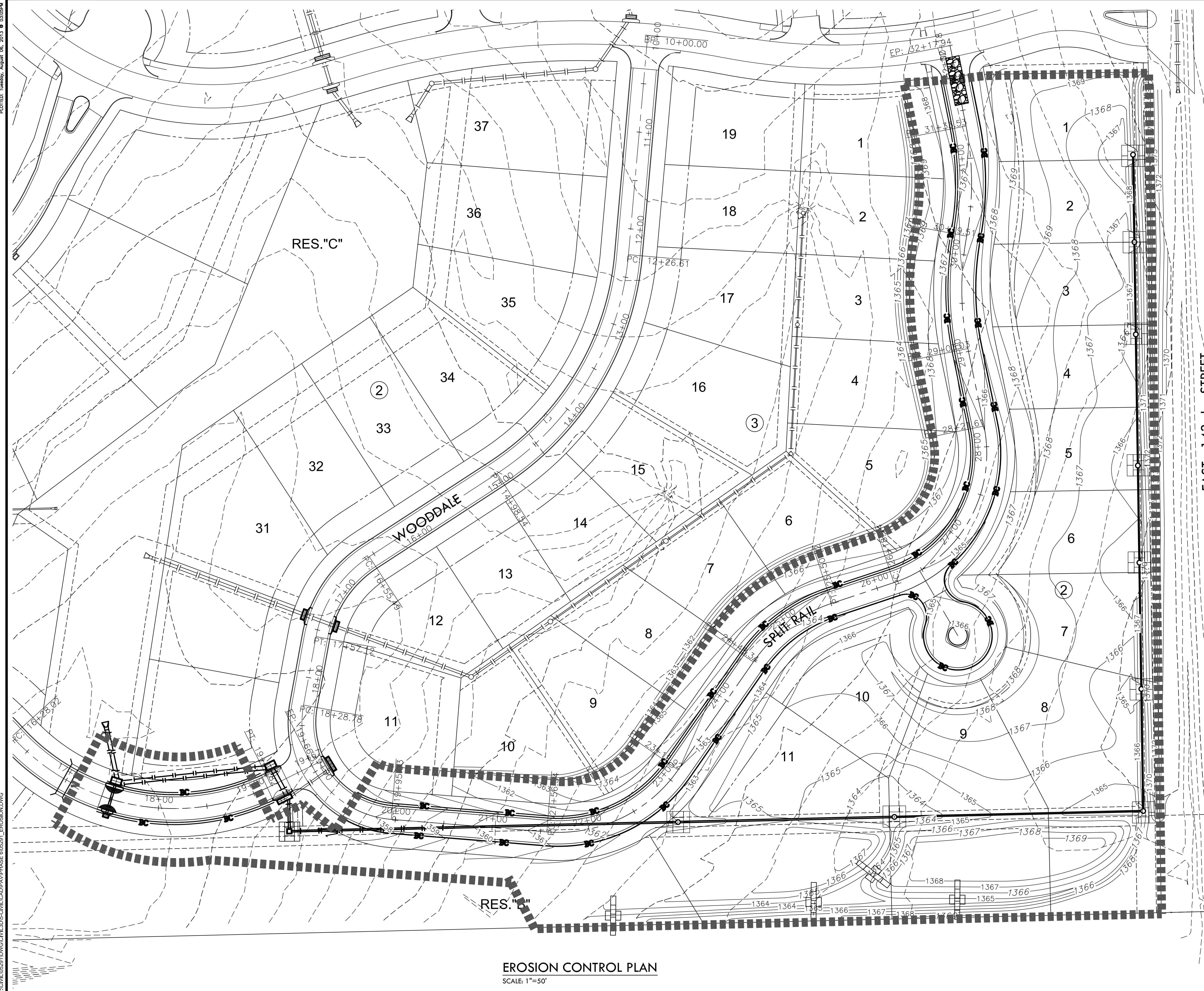
EROSION CONTROL PLAN SCALE: 1"=50'