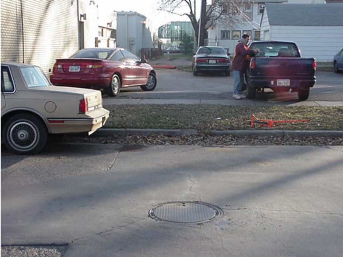
Standing in Oak Street, west of MH 5446-108, looking east