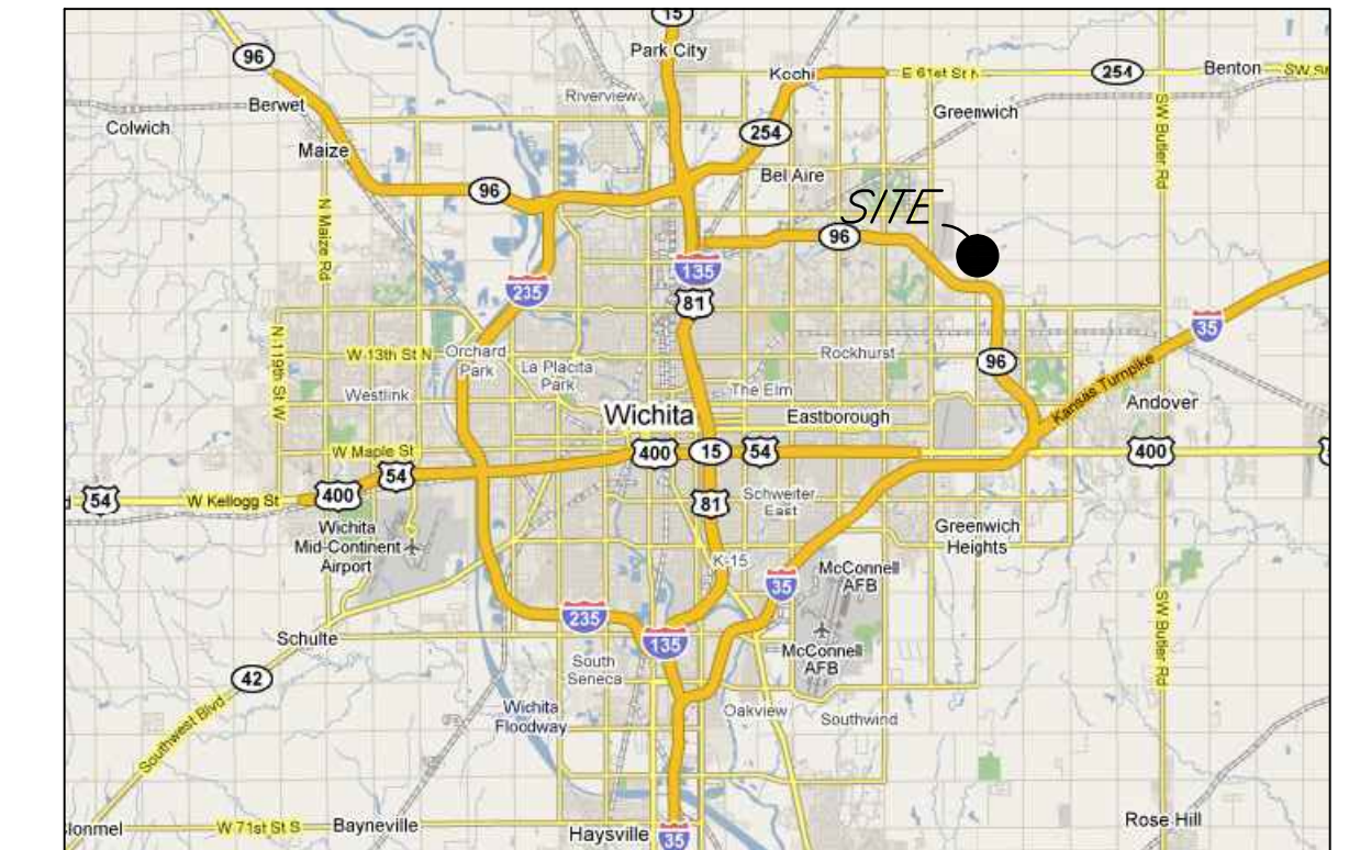
LOCATION MAP (For Visual Use Only)