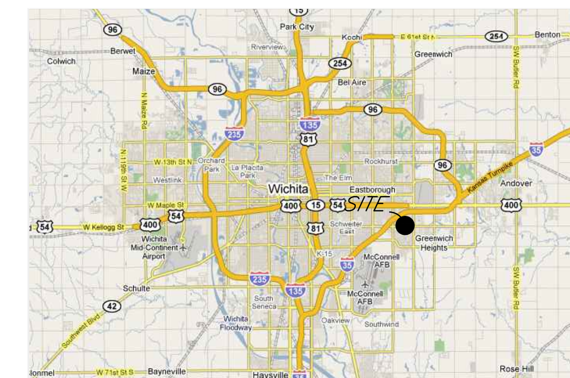
LOCATION MAP (For Visual Use Only)