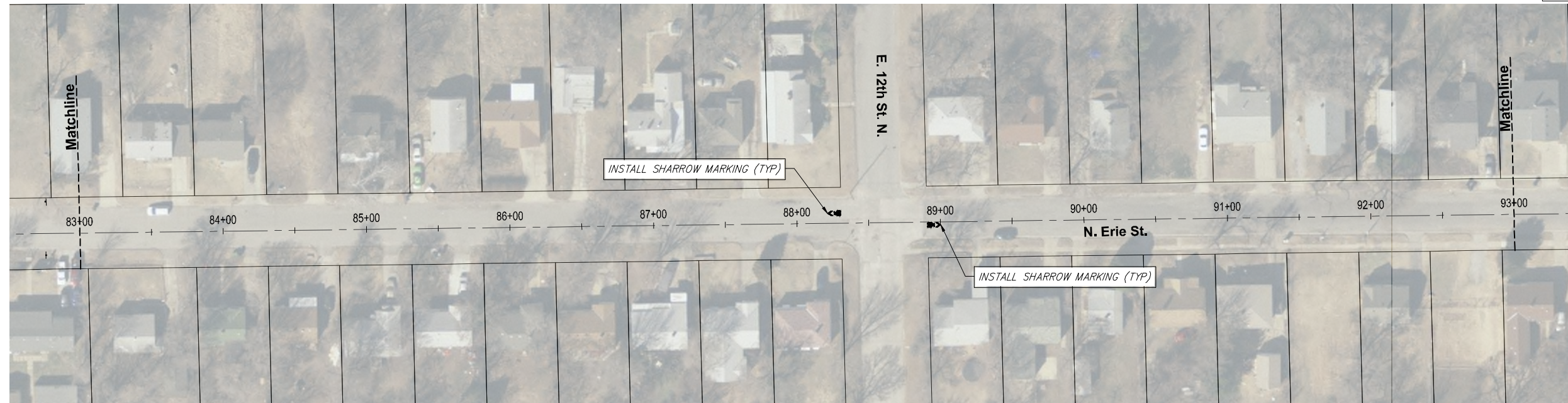
STA 83+00 TO STA 93+00 SCALE 1" = 40' - 0"