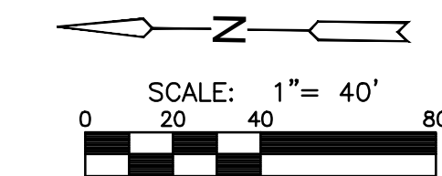
PLAN LINE 2 PROFILE LINE 2

NOTE: CONTRACTOR TO VERIFY LOCATION AND ELEVATION OF EXIST. WATER LINES AND ALL OTHER UTILITIES PRIOR TO CONSTRUCTION.